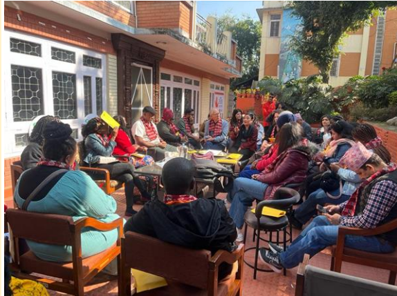
Members visiting the secretariat of Girls Not Brides Nepal.