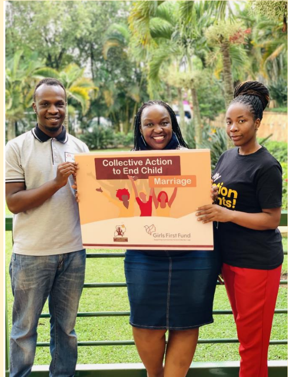
There is power in collective Action to End Child Marriage.

There is power in standing together in collaboration and partnership to address issues affecting the well-being of Ugandan Children.