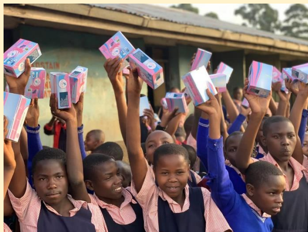
Girls in Kisoro after receiving sanitary products.

The boys have been meaningfully engaged and informed that menstruation is normal and happens to all girls and women in their lives. Therefore, the need to be supportive and break the stigma has been well emphasized as opposed to humiliating and embarrassing them when they stain their dresses both at school and at home.