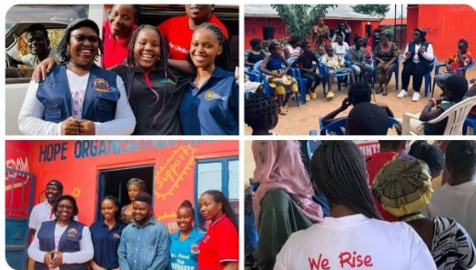
RTU team at HOPE Training Center in Nakivale Refugee Settlement.

It's difficult to wake up one morning and everything you ever owned is no longer available for you.