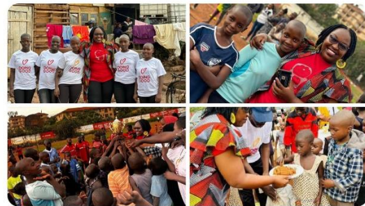
GOOD DEEDS DAY- Reaching out to Children in Katanga Slums:

This is why we find it important to reach out to refugees and share the little we can with them. This can be information, basic needs and helping the children to attain some life skills such as decision making, goal setting, public speaking, resilience, confidence to mention but a few.