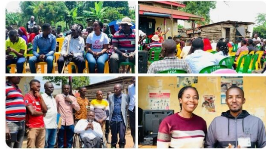
A Dialogue meeting with Parents and Leaders in Namayumba.

Our dialogues with parents and leaders also bring out the importance of giving girls who have given birth an opportunity to resume formal education and be able to complete their education. This has been embraced and now we are seeing more girls being rescued from Child Marriage and support to go back to school.